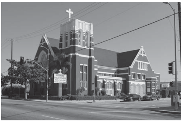
Engine House No. 18 and the Greater Page Temple are among landmark properties in the Charles Victor Hall Tract.