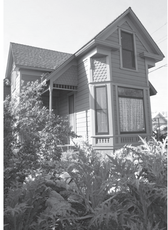
The Farmhouse as found (above); today its Victorian nature re-revealed

addition and many interior elements. It had decayed rapidly to the extent that the public questioned whether the site could, but more importantly, should even be saved.